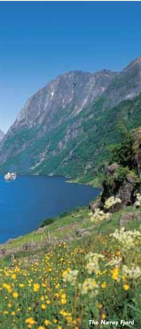
The Nærøy Fjord