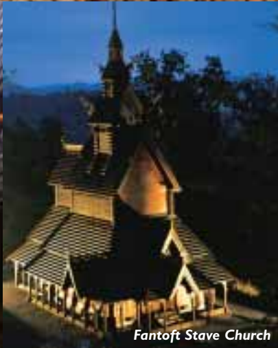
Fantoft Stave Church