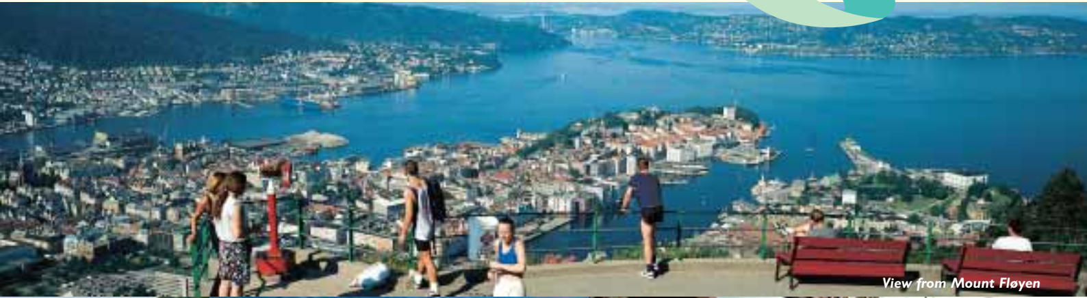
View from Mount Fløyen