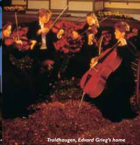
Trolldhaugen, Edvard Grieg's home

painter, Johan Christian Dahl, and the hugely popular composer, though small in stature, Edvard Grieg. The dramatist Henrik Ibsen was not born in Bergen, but it was here that he entered the world of theatre. The painter, Edvard Munch, was not Bergen-born either, but it was a Bergen industrialist who ensured that the city now has a unique collection of Munch's works.