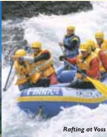
Rafting at Voss