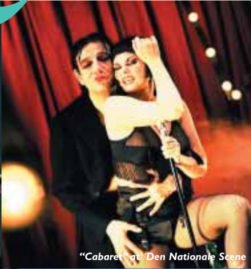
"Cabaret" at Den Nationale Scene