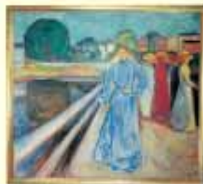
Edvard Munch: The Quay 1903, Bergen Art Museum

Aside from their commercial interests, Bergen merchants had a nose for culture. It was they who laid the foundations for Bergen to be the cultural city it is today. Bergen has