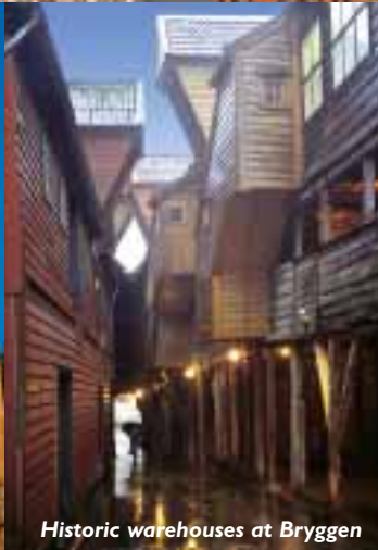
Historic warehouses at Bryggen