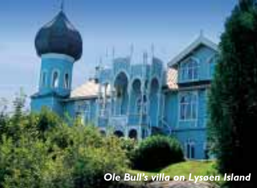
Ole Bull's villa on Lysøen Island