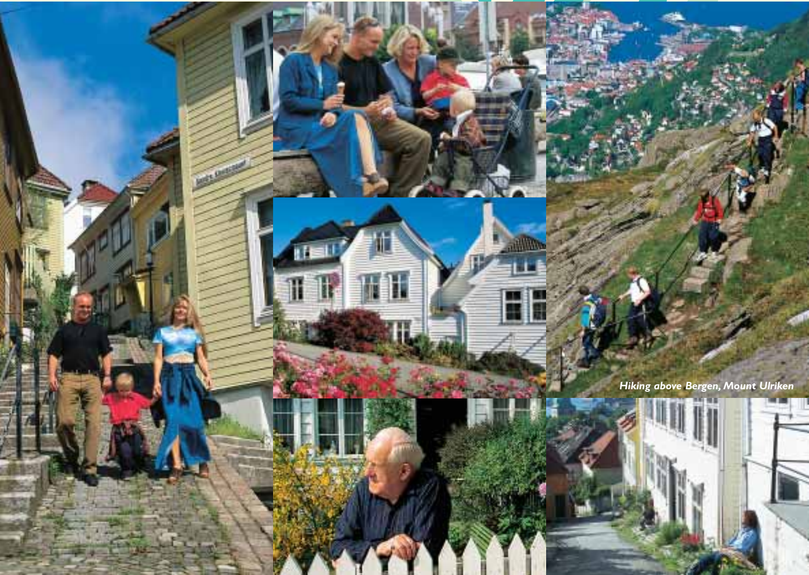
Hiking above Bergen, Mount Ulriken

Clusters of old houses cling together in among the new quarters. Bergengers take a keen interest in protecting their grass-root traditions and building styles, and Bergen architecture is distinctive yet diverse. Though Bergen has suffered many fires over the centuries, it still has one of Europe's largest conglomerates of wooden houses. Not to say the largest.