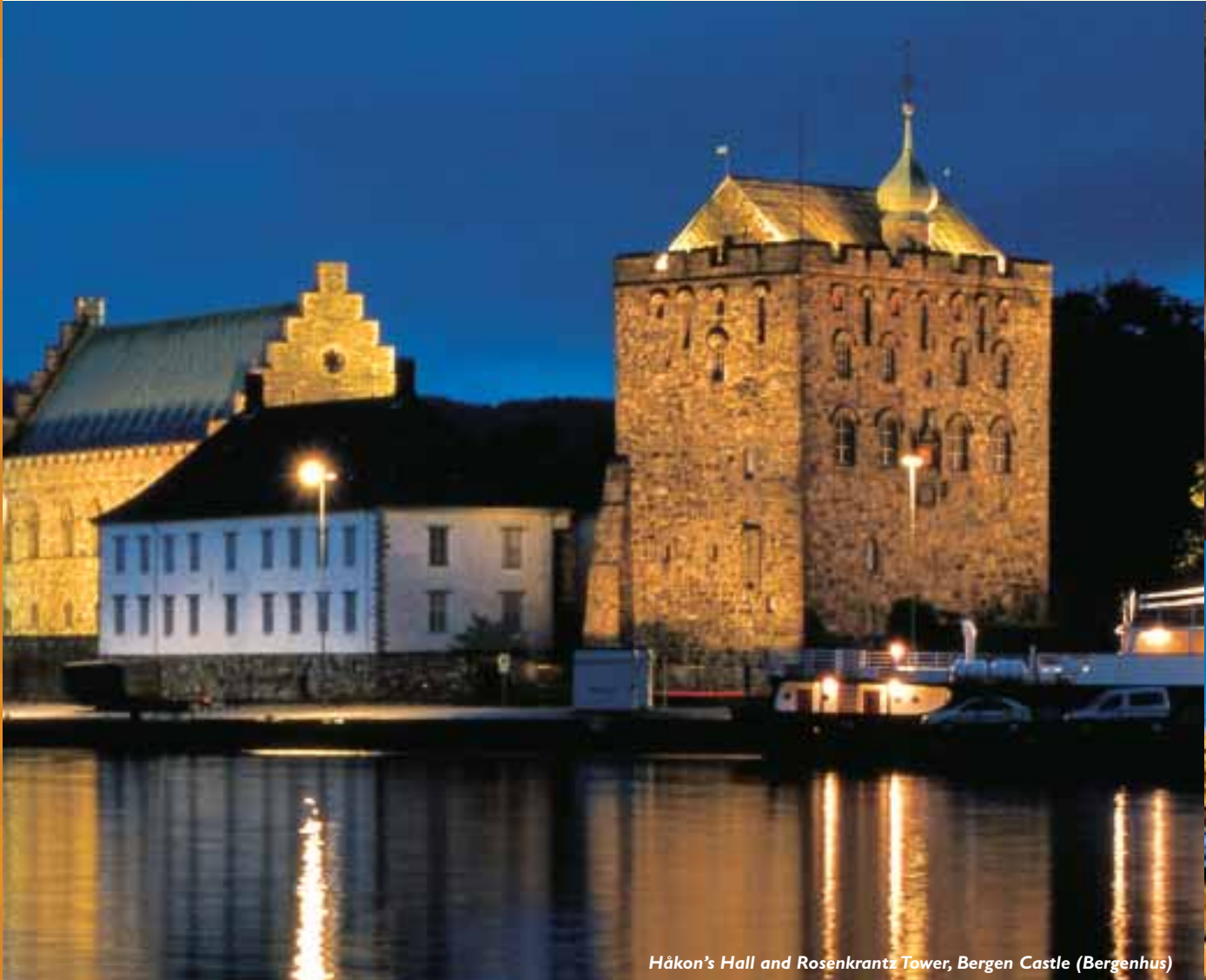
Håkon's Hall and Rosenkrantz Tower, Bergen Castle (Bergenshus)

Bergen has given a warm welcome to its visitors for more than 900 years