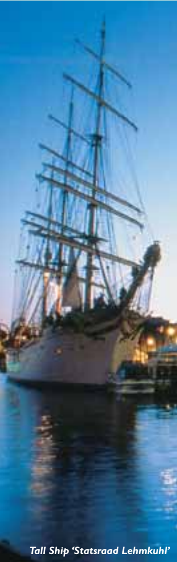
Tall Ship 'Statsraad Lehmkuhl'