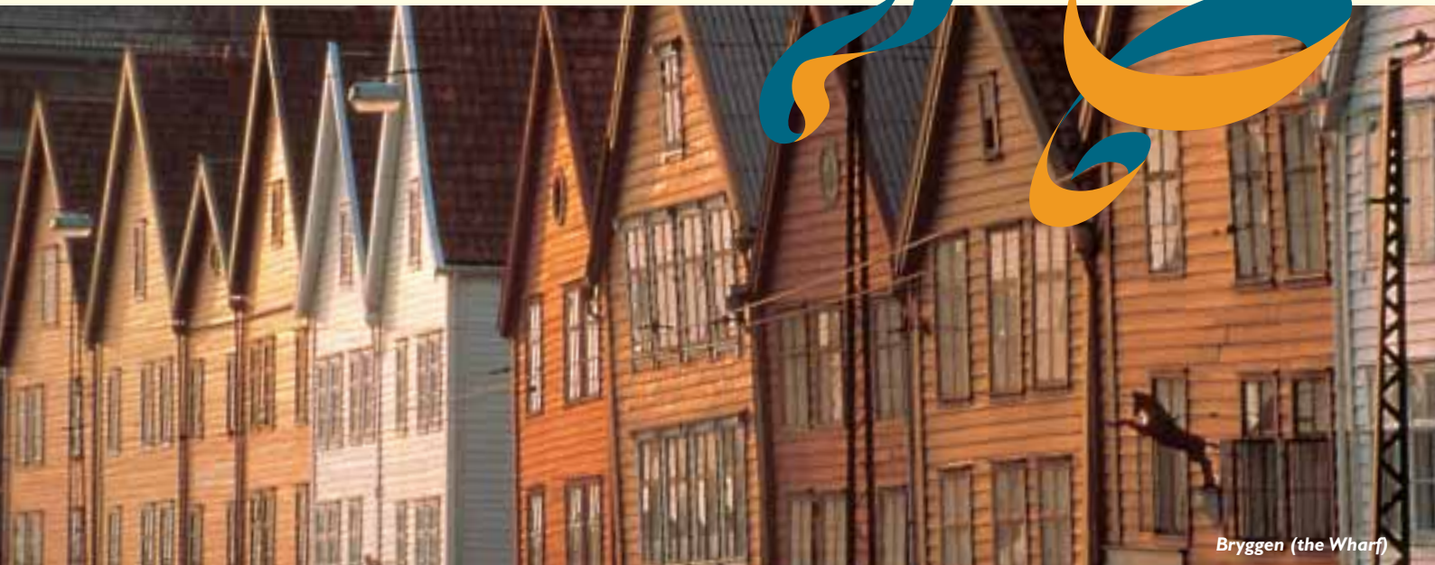
Bryggen (the Wharf)