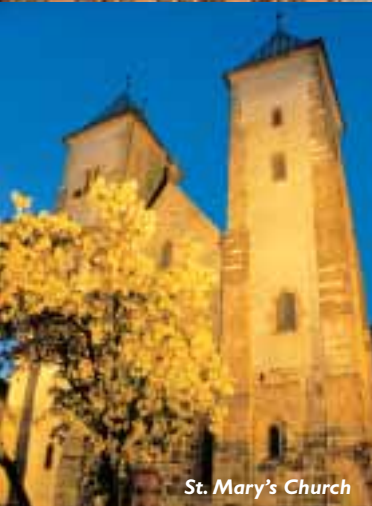
St. Mary's Church