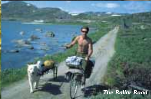
The Rallar Road