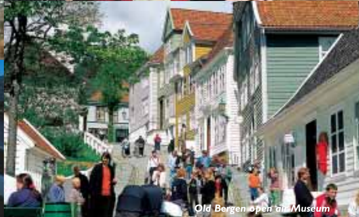
Old Bergen open air Museum

Come to Bergen in the summer when the land is lush in every shade of green; when the fjords are abuzz with small boats, and the city is alive with visitors.