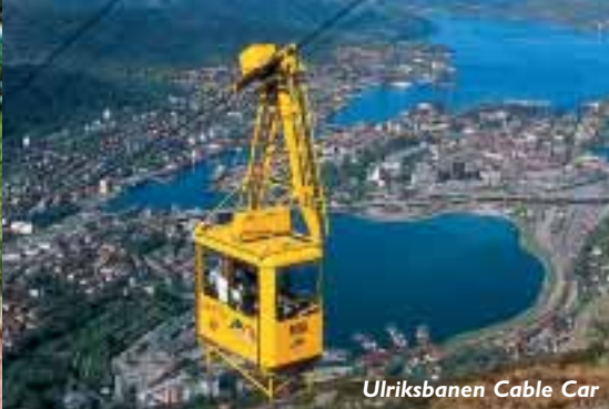
Ulriksbanen Cable Car